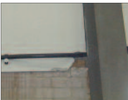
This damaged AIB needs to be covered and protected from further damage