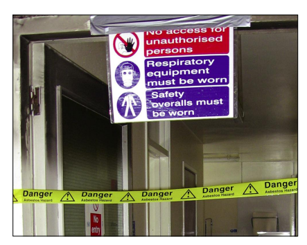
Make sure you restrict access